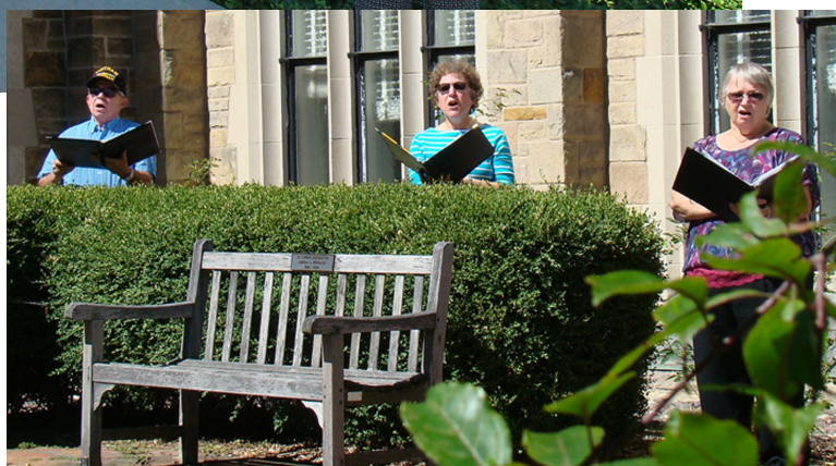
On August 30, Chancel Choir members gathered in the courtyard to record music that will be included as part of Union Church's Reunion Sunday online worship service.