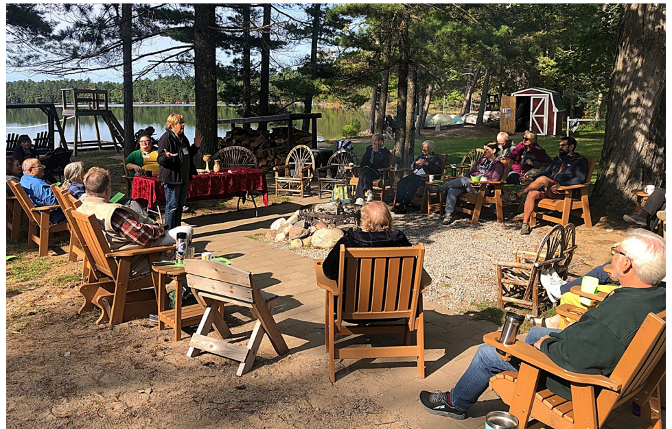
A total of 41 people attended the Dick Lathrop Memorial All-Church Retreat held at Moon Beach from September 10-12.